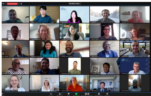
SLA 2021 Fellows